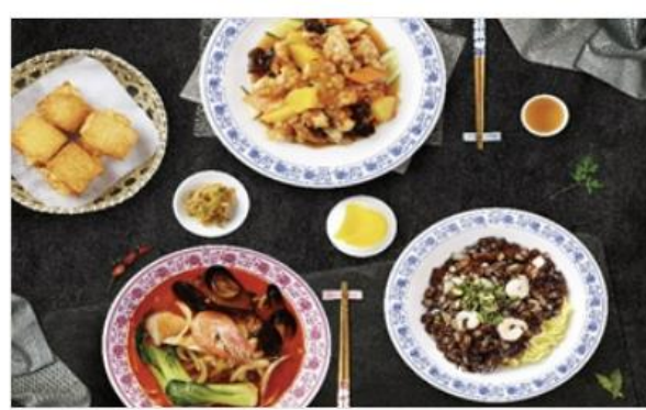
신차이 5층 전문식당가