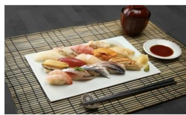
메시호산 5층 전문식당가